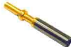
#1245 Socket (gold)