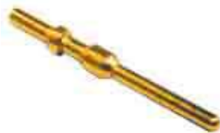
#1244 Pin (gold)