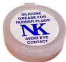
#0241 Silicone Grease for rubber plugs