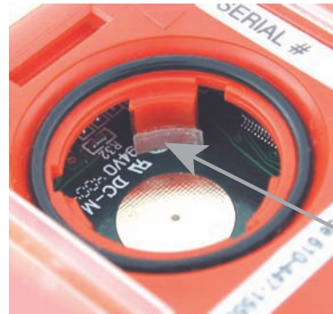
Install Adhesive Spacer Here