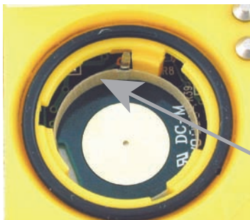
Mylar Ring- remove before installing spacer (if applicable)