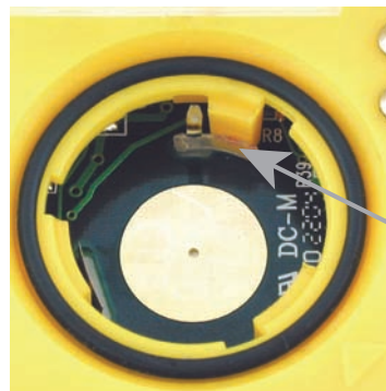
Install Adhesive Spacer Here